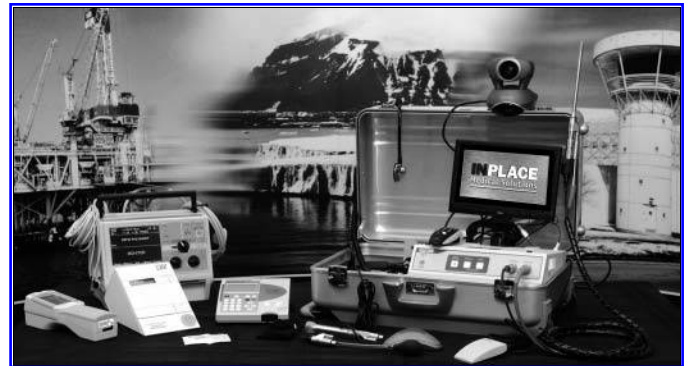
Fig. 1. NuPhysicia provides a suitcase with diagnostic tools and a videoconferencing device, everything the onboard medic will need to communicate with the onshore physician.

InPlace Medical Solutions modifies its daily package depending on the needs of the oil company. It includes board-certified physicians the company has contracted with, diagnostic tools, the videoconferencing device, supplies, 128 prescription medications, and an electronic medical record. Polycom of Pleasanton, CA, manufactures the NuPhysicia-developed videoconferencing device (Fig. 1). The offshore equipment includes a digital stethoscope; a 12-lead ECG machine; and a multipurpose medical scope with halogen fiber-optic lighting for examining ears, nose, throat, and skin through high-resolution magnification. The offshore medic operates the equip-