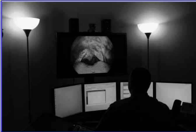
Fig. 3. A NuPhysicia physician evaluates a patient's throat at the company's telemedicine studio.

e-mail. Calls come into the facility's worldwide emergency communications center. An emergency-medicine physician fields the call. In addition, physicians in the telemedicine office or emergency department can handle simultaneous calls. Remote Medical partners with the GW University program to provide physician consultations.